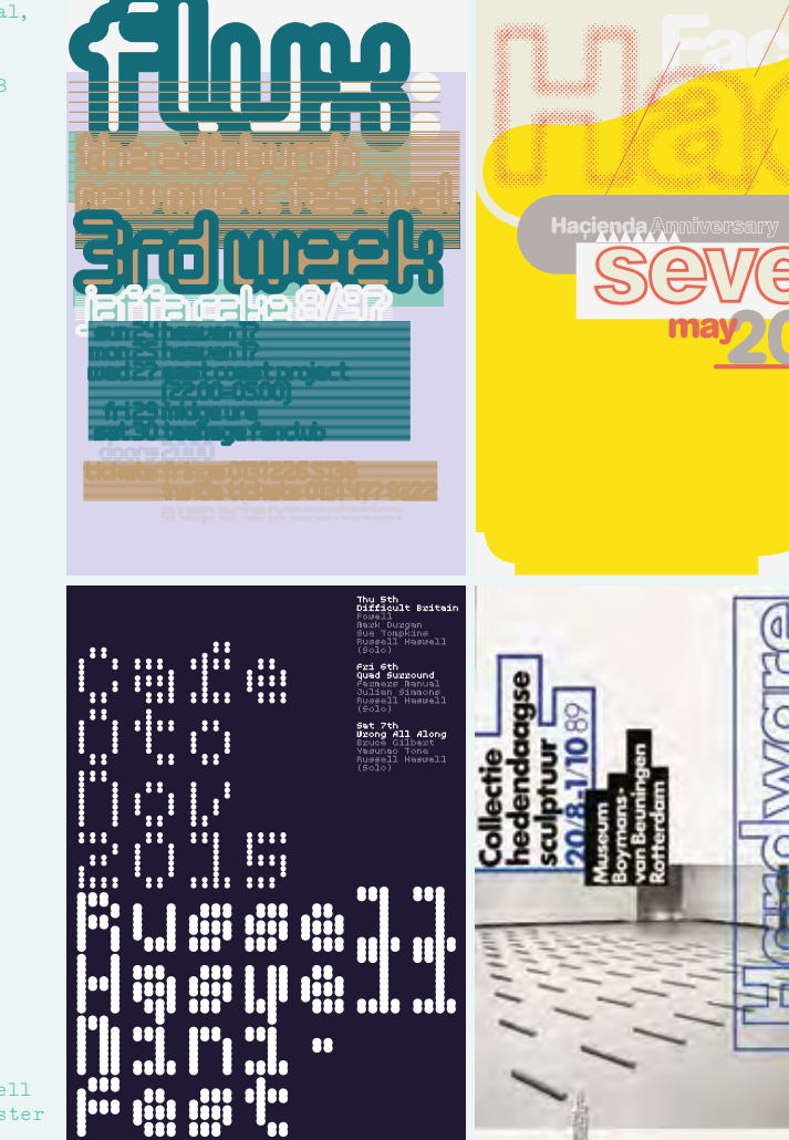
Cafe Oto Russell Haswell mini-fest poste

Flux New Music Festival, Edinburgh Posters 1997 and 1998 MuirMcNeil