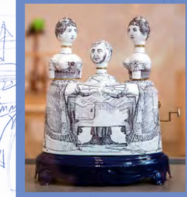
Discombobulated Brexiteer, tograph by Iona Wolff

Process exploration has resulted in the creation of a pallet of aesthetics that I then employ to communicate satirical narratives. Work stays relevant through the subject matter I depict, and in fact, because the works centres around political narratives, that by their very nature are ever changing, work becomes relevant and then dated very quickly.